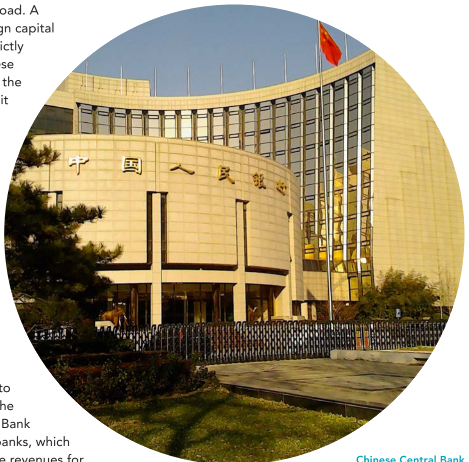
Chinese Central Bank

The Chinese empire required an injection of capital to build its own infrastructure and a national industry, and to be able to compete with the colonial powers. There were also war debts, imposed by the same colonial powers after the Opium Wars and the failed Boxer Rebellion. As a result, China had to borrow from Western banks, and pay interest on its loans. You can still see the old buildings where these foreign banks settled in the city of Guangzhou. It was probably this unequal colonial treatment that led Mao Zedong to declare in his publication The Chinese Revolution and the Chinese Communist Party (1939) that China's financial sector was monopolised by the colonial powers with their banks and loans. During the Mao-era China hardly borrowed from foreign banks or powers, and largely closed itself off from the international capital markets. After the death of Mao, successor Deng Xiaoping created