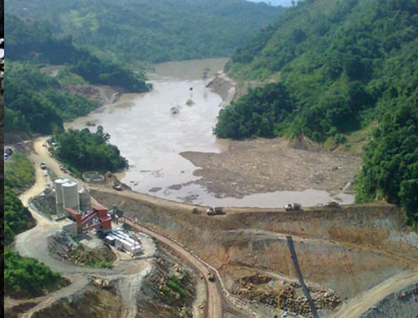
LEFT: The Sogamoso River valley. Photo: © Vereda Sogamoso, 2011. RIGHT: Construction site of the Hidrosogamoso dam. Photo: © Vereda Sogamoso, 2011.

the contract for construction work. The Colombian branch of the German company Siemens constructed the power-houses for the dam and the German affiliate of Austrian company Andritz will source the turbines. 2 In December 2012 the German government provided Banco Santander with an export credit guarantee of approximately US$73 million for financing that the latter provided to Andritz. 3