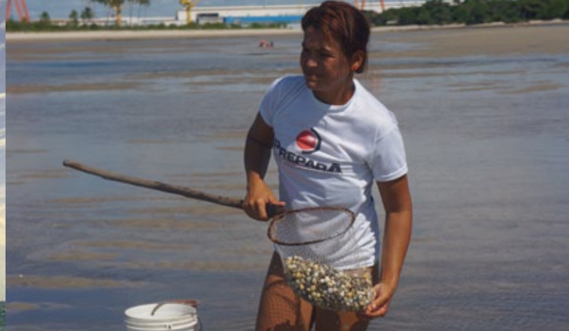
LEFT: Van Oord's 'Wavewalker' drilling and blasting platform used to blast the rocky sea bottom. RIGHT: Marisqueiras at work in Suape port area, with shipyard in the background.

in the port. Since 1995 the Dutch company Van Oord has undertaken various dredging activities in Suape. 2 In 2011 and 2012, Van Oord won tenders for two new dredging projects, for which it obtained export credit insurance from the Dutch government via the export credit agency Atradius Dutch State Business (Atradius DSB).