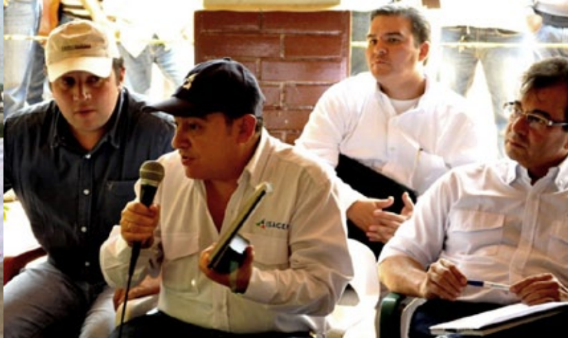
LEFT: Protests of the local population of the Sogamoso River basin. RIGHT: ISAGEN “consultation” meeting with communities.

The company has provided 186 families with compensation. 7 However, locals argue that this group represents a small subset of those who have lost land, employment and food security as a result of the project. They further argue that the compensation that has been awarded does not correspond to the losses suffered. 8