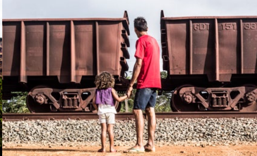
LEFT: One of the iron mines in Carajás. RIGHT: Residents of the rural 'Francisco Romão' settlement in Açailândia, Maranhão, waiting to cross the rail line.

On July 26, 2012, a federal judge recognized the irregularities in the licensing process and ordered that construction on the rail line be halted until Vale revised its impact studies, carried out public meetings in the twenty-seven municipalities that the railway crosses, and obtained the free, prior and informed consent of affected indigenous and quilombola communities.