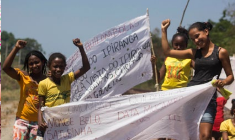
LEFT & RIGHT: Protest of quilombola people on rail lines, Itapecuru-Mirim, Maranhão, Brazil.

Development (BNDES), a Brazilian public bank, has approved two loans - worth a total of US$4.5 billion - to Vale for the expansion project. 4