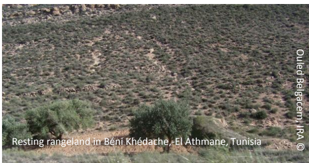
Resting rangeland in Béni Khédache, El Athmane, Tunisia

In Médenine, Tunisia areas of rangeland left without grazing for 3-5 years improve the plant cover and diversity for the next period of grazing. This helps to avoid land degradation from overgrazing. An increase of infiltration, soil organic matter and runoff control are secondary benefits.