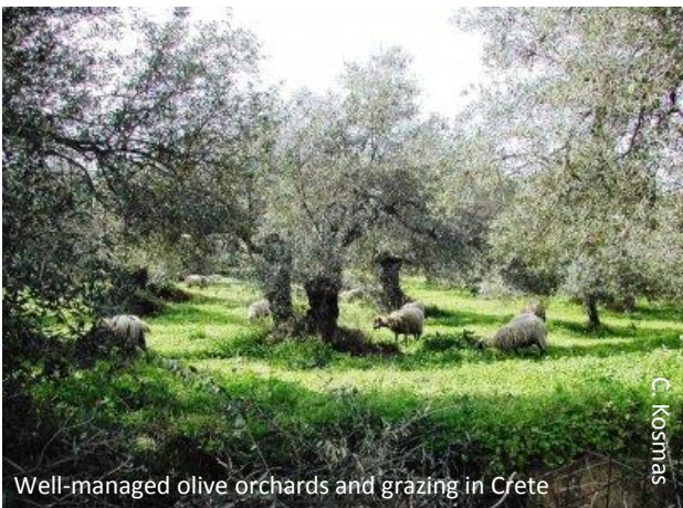
Well-managed olive orchards and grazing in Crete