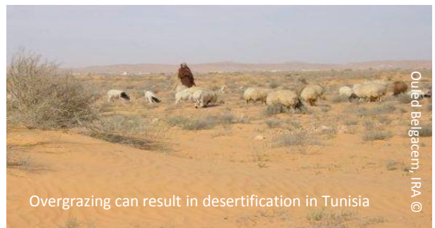
Overgrazing can result in desertification in Tunisia