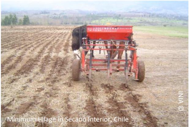
Minimum tillage in Secano Interior, Chile

In the Goís region of Portugal controlled fires are used to control the bulk and extent of forest or scrubland biomass fuel, with the aim of enhancing grazing areas and limiting the spread of the inevitable wildfires. Prescribed fire helps to maintain habitat diversity and to reduce invasion by alien species. In contrast to wildfires, prescribed fire is expected to reduce soil erosion and to improve physical and chemical soil properties.