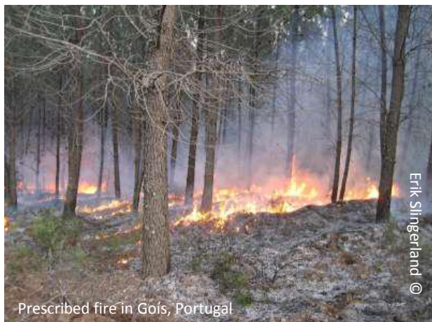
Prescribed fire in Goís, Portugal

Optimum chances for enhanced sustainability and biodiversity, and avoidance of land degradation, can be achieved by good management, as in the example below.