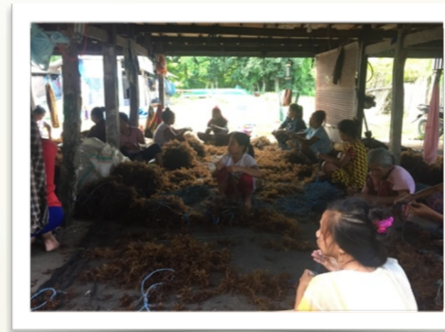
Seaweed culture and processing were the main livelihood of the communities especially the women.

Currently, Bangkala community are suffering from the impacts of the plant. We have no land to grow corns, and sweet potatoes, which were once our main source of livelihood. We have no fish to catch. We can no longer cultivate seaweed as the breeding farms have been destroyed. Our coast has also been severely degraded, and is not as beautiful as it used to be.