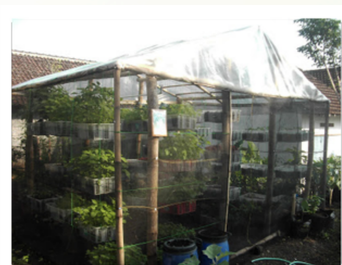
'Organic Vegetables House' at family scale

cabbage), arugula, kale, Lorenzo, zucini, rocket, cauliflowers, okra, tomatoes, papayas and many more.