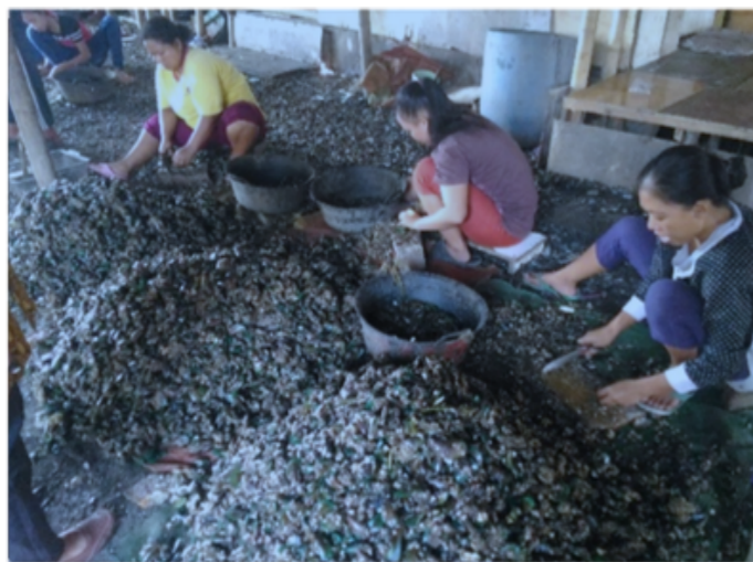
Cleaning and processing mussels (SP doc)

In the last few years, my income has been steadily declining. In the past, I could earn IDR 300,000 (approx. US$ 22) every day. Nowadays, I sometimes earn nothing. As such, to make ends meet, I borrow some money from moneylenders, which I have to repay in installments every day. My husband collects and sells fibre ropes and used drums (round containers) and makes little money.