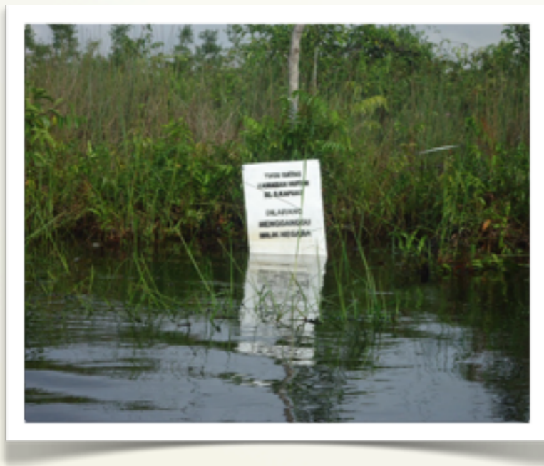
A notice board saying a prohibition of villagers to enter the forest.

KFCP caused problems for the community, including women. The community members, men and women, could no longer access the forest easily. The forest in which the project was being implemented was prohibited to enter as it was designated as protected forest. Notice boards were erected prohibiting the villagers from entering the forest. KFCP was also supported by the Swamp Office (Balai Rawa), which built permanent dikes to prevent access into the forest. As noted above, the river has been the only way through which the forest (where our farms are located) can be accessed.