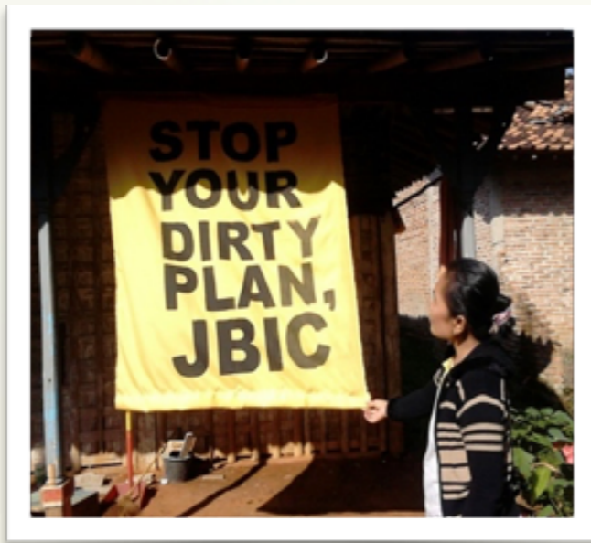
A protest placard against the thermal power plant and JBIC (Japan Bank for International Cooperations).