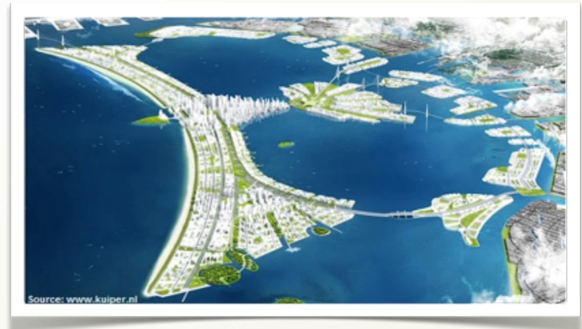
A mega project in form of the mythical bird Garuda dubbed as National Capital Integrated Coastal Development (NCICD)

Furthermore, the sea, which provides food and nutrition to humans, should be accessible by all the people, and should not be monopolized or privatized. In light of this, the government's plan, in collaboration with businesses, to make Jakarta Bay a commercial area disguised as a project for the sake of communities, cannot be justified.