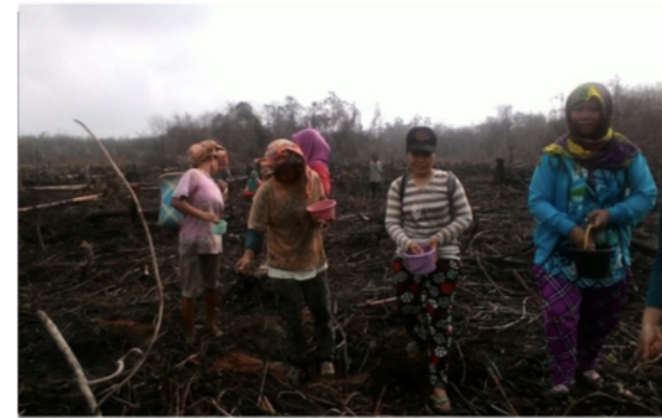
Dry land rice planting

company into conflicts with those opposing it, who kept struggling to reclaim their lands that had been grabbed by the company.