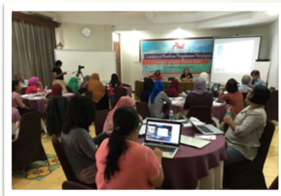
The Workshop on Story Telling, 31 January - 1 February 2017 in Yogyakarta