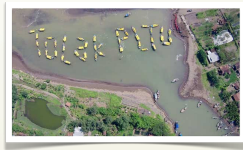
Formation of fisher boats saying 'reject the steam-power plant'.

When it was reported that the president would come to observe the progress of the plant development, the local community assisted by some activists performed an action at sea, voicing the impacts of the project on the community. As the president did not turn up, the protesters left some letters containing their aspirations with the Air and Marine Police (Polairut). Does the President not promise to bring prosperity to the nation? Then why is he not willing to hear our aspirations? We feel that our complaints have never been responded to, nor have they ever been heard at all. Government officials seem to close their eyes to our protests. To them, investments more important than the people's lives.