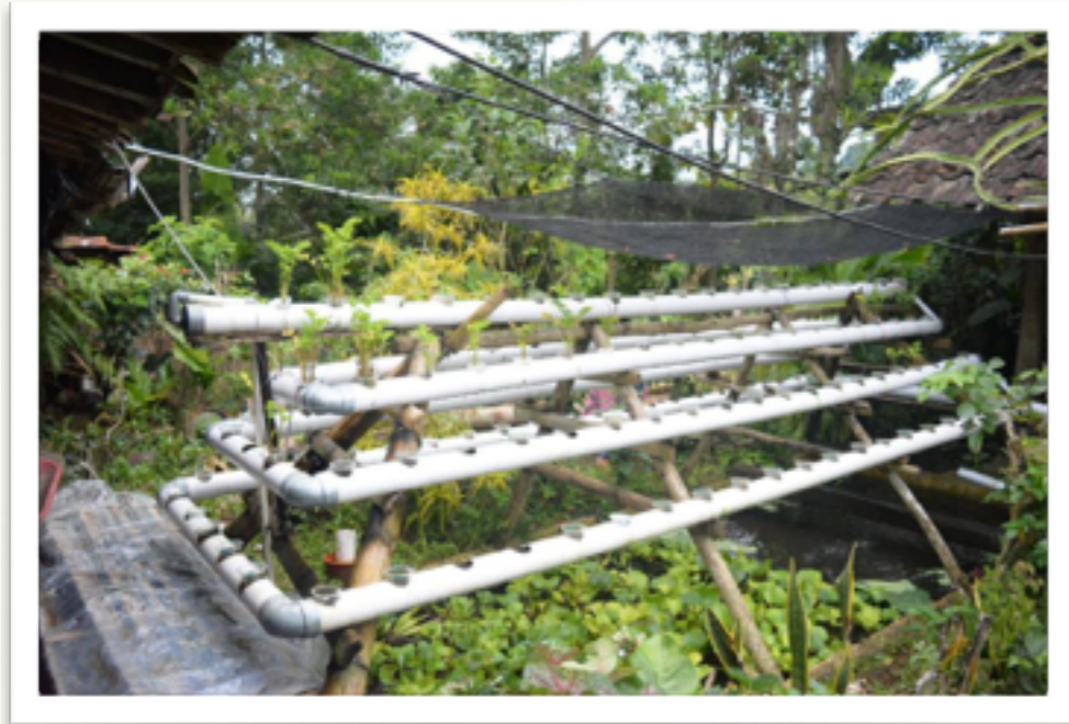
Aquaponics farming by 5 women's groups in villages in Temanggung, Central Java.