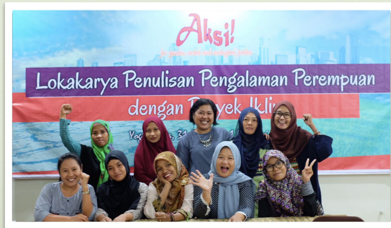
The writers of women's testimonies

Good and bad project indicators as the conclusions drawn from women's experience in Chapter 2. can be seen in Tables on the next page.