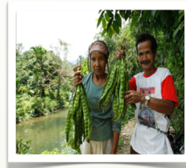
Villagers of Lubuk Beringin could meet their daily food needs from their garden.

go to the land owners. The villagers, however, rejected the offer as they had seen what happened to their neighboring village where such a scheme had been implemented. The promises made by the company were so sweet that those giving up their lands did not do anything to the company even though they received nothing promised after the period was over. We, the approximately 100 households living in Lubuk Beringin, live a simple ordinary life. We can afford to send our children to school and we earn enough to live by managing the resources we have.