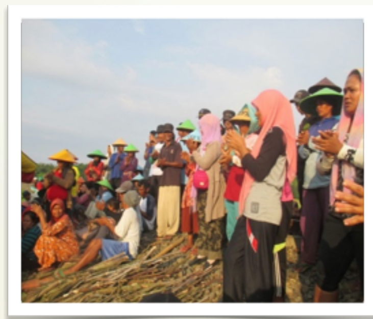
Protest actions by Batang fisher and farmer communities against the thermal power plant.

In addition to the impact on the local economy, the project has also adversely impacted the social lives. The pro and con groups no longer greet each other, having prejudice against each other. My expectation is for all the community to work hand in hand to preserve the environment, eliminating the prejudice, putting aside selfishness, making no distinction between leaders and non-leaders. Let's fight together to defend our lands, sea and environment for future generations.