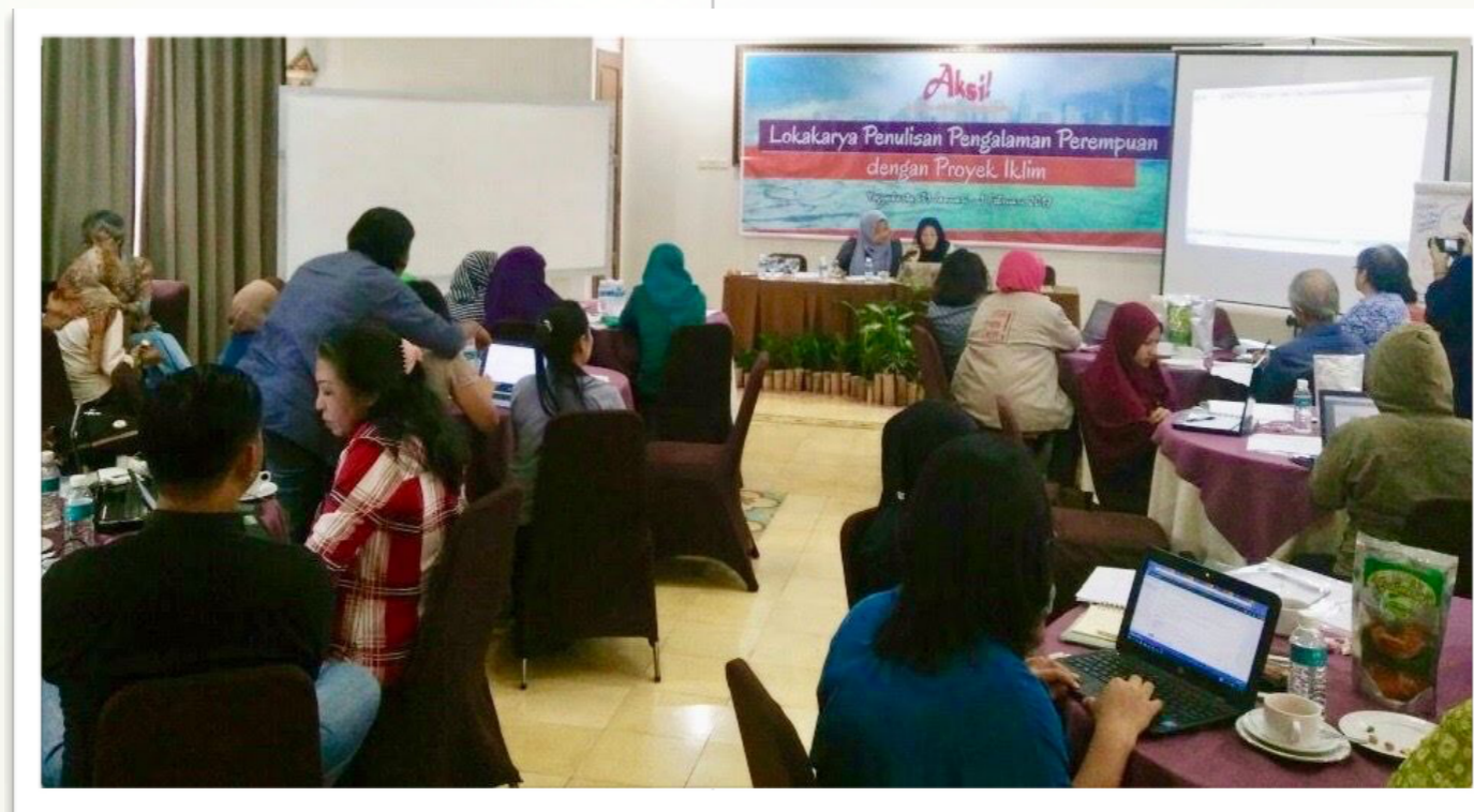
The Workshop on Story Telling, 31 January - 1 February 2017 in Yogyakarta

practice based on the experiences of those eight women. Chapter 4. is about the conclusions and recommendations for parties that provide climate finance, especially to the GCF and its partners in Indonesia such as NDA 4 Indonesia and the Indonesian government, project implementers and civil society activists and organizations working on climate financing, the environment and gender equity.