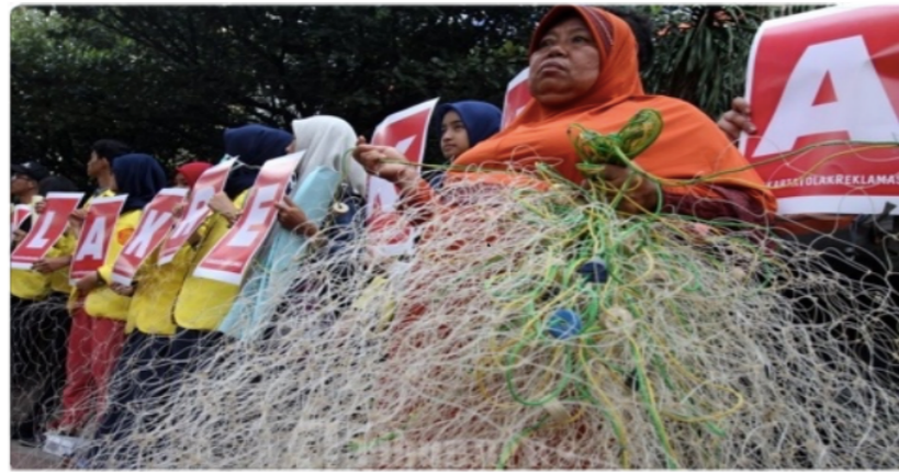
Protest actions against the reclamation activities of Jakarta City government

The Garuda project was a result of an assessment by a Dutch engineer and business consultant consortium comprising Witteven+Bos, Royal Haskoning, SWECO, Deltares, and Ecorys. In addition, the government of South Korea agreed to grant USD9.5 million for the project research. I am convinced that the project was initiated with vested interests in mind, completely putting aside the interests of common people.