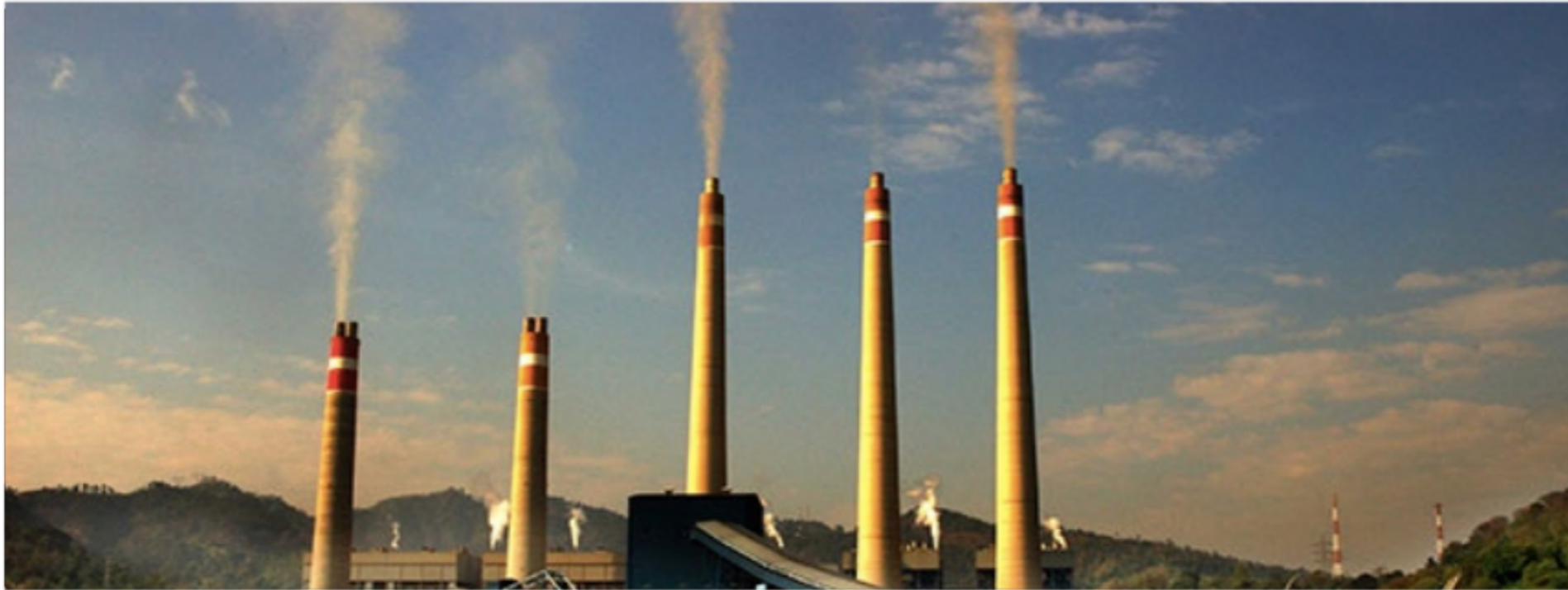
The Thermal Power Plant in Bangkala.

Help us save Bangkala community from climate change and environmental degradation!