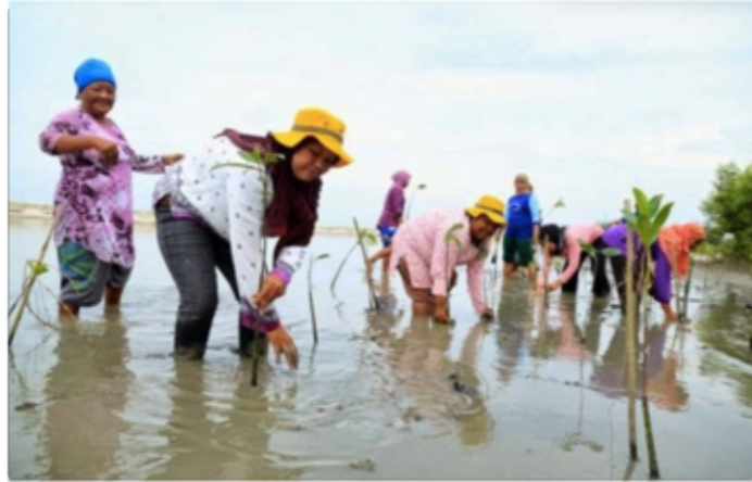
Fisherwomen's group in Muara Tanjung.

started to further utilize the trees, processing them into a number of commercial food products such as kerupuk jeruju (chips), syrup, tea and dodol (a sweet toffee-like sugar palm-based confection). We also processed – and have been processing – the catch into chips.